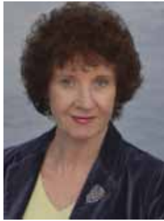
Hilma Wolitzer Fiction Judge