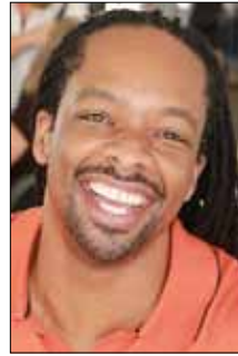
Jericho Brown Poetry Judge